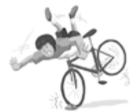
(he / ride / a bike)