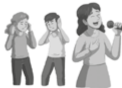
(she / sing)