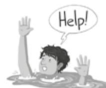
(he / swim)