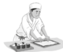
(he / make / sushi)