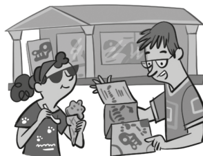
Dad and me!

Yes, she was . No, they weren't . Yes, there were . No, she wasn't .